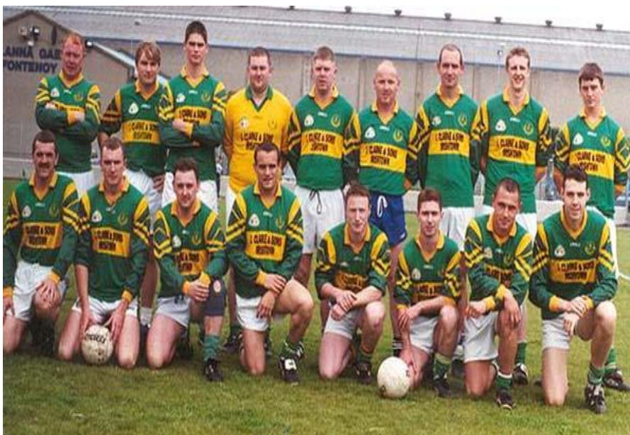
Our Moran Cup team from 2001 – how many do you recognise?